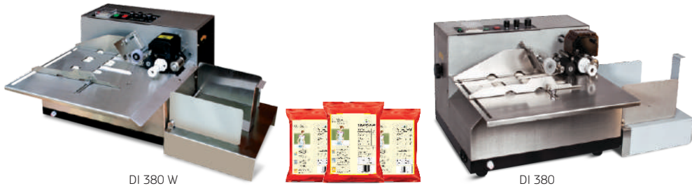
DI 380 W